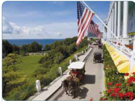
PHOTO: GRAND HOTEL

More than half of the film was shot at Grand Hotel, the world’s largest summer hotel. It sits on a scenic bluff overlooking the Straits of Mackinac and the Mackinac