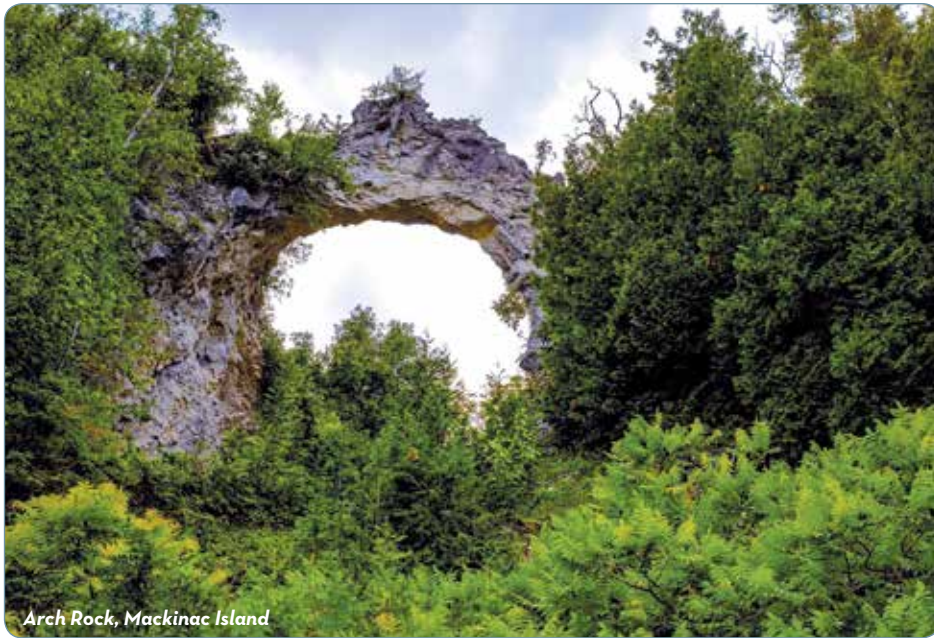
Arch Rock, Mackinac Island

Wooden stairways lead up to the top of the rock.